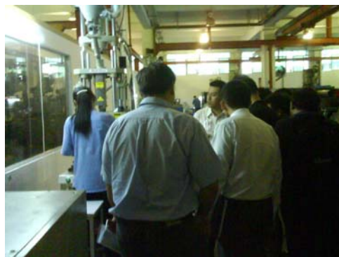
Analysts viewing the plastic injection process