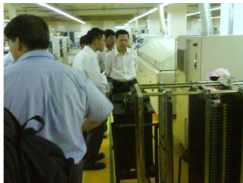
Visiting the SMT lines