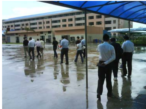
A walk about with the workers' dormitories in view