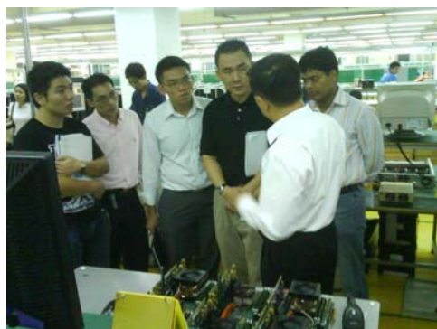
Management explaining the production process to the analysts